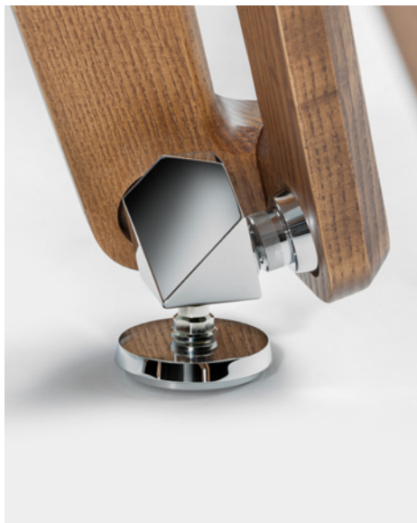
Polished metal components Chrome connecting joint