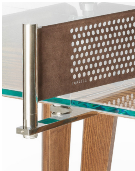
Removable Alcantara Net